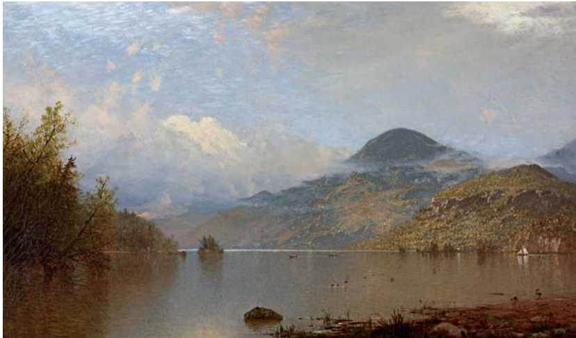
5. John Frederick Kensett. Black Mountain, Lake George , n.d. Oil on canvas, 14 \frac{1}{8} x 24 in. (35.9 x 61 cm). Museum of Art, Rhode Island School of Design, Providence, Gift of Jesse H. Metcalf (20.029).