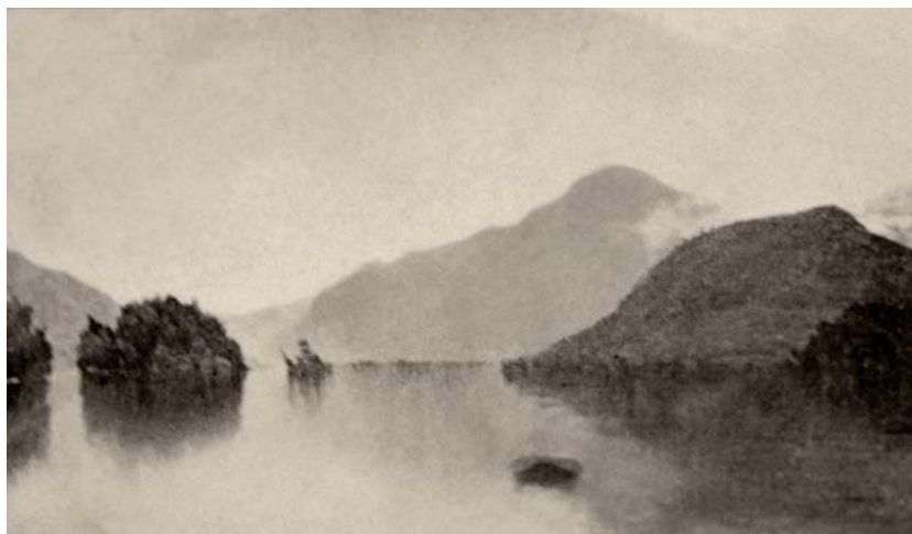
6. John Frederick Kensett. Lake George , n.d., 13 \frac{3}{4} x 23 \frac{3}{4} in. (34.9 x 60.3 cm). Location unknown. From Kensett Estate Sale Album 1873, pl. 5