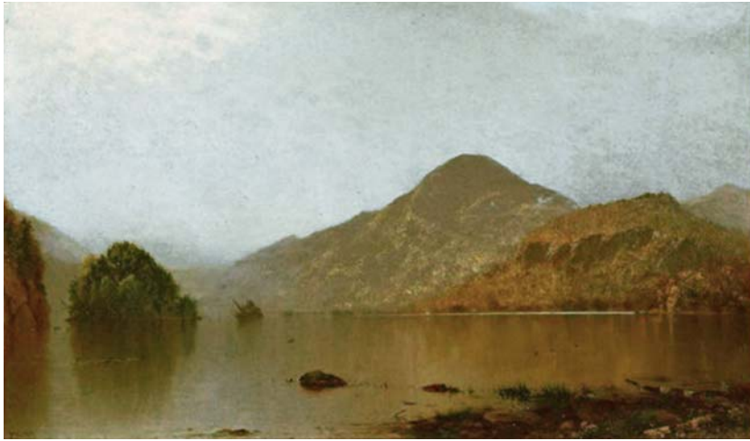
4. John Frederick Kensett. Lake George, 1872. Oil on canvas, 12 x 24 in. (30.5 x 61 cm). Private collection.